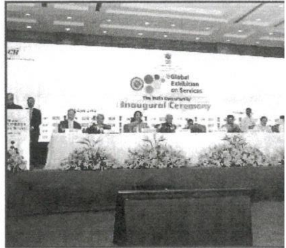
Inauguration of GES 2016 by Hon'ble President of India on 20 April, 2016