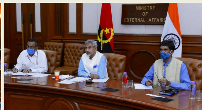
MoU with Angola signed on the margins of 1 st India-Angola Joint Commission Meeting