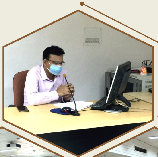
Speaker addressing on webinar to participants of the Promotion-related Training Programme