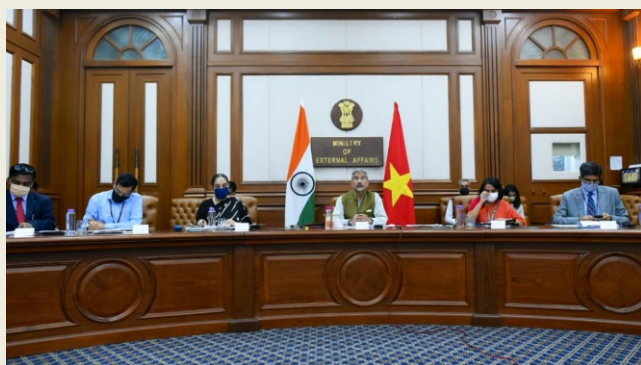
MoU with Vietnam signed on the margins of 17 th India-Vietnam Joint Commission Meeting