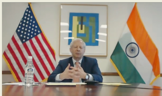
▼ H.E. Mr. Kenneth I. Juster, Ambassador of US to India interacted on webinar with the IFS OTs