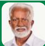
Shri Kummanam Rajasekharan The Hon'ble Governor of Mizoram

"It is time for a nutrition revolution in India and it is important to work to achieve that to end malnutrition. This nutrition engima calls for a multi-sectoral approach involving areas including agriculture, health and rural development to ensure nutrition for people across the social spectrum"