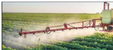
World Crop Protection Congress