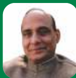
Mr. Rajnath Singh Hon'ble Minister of Home Affairs, India

"The social, cultural and financial health is dependent on the farmers. Farmer is the preserver of individual dignity, societal dignity and national dignity as well as the protector and savior of our lives. We need all the agriculture scientists, philosophers, all the stakeholders to work together and save the world from global warming, environmental degradation by moving towards organic production."