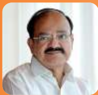
Shri M. Venkaiah Naidu Hon'ble Vice President of India

"The effects of climate Change are impacting every aspect of life including agriculture, we need to evolve strategies to cope with the changing climate, depleting resource base and increasing food demand. This calls for policy changes in agriculture sector. We should focus on developing climate resilient crops. We need to develop crops that can withstand extreme weather conditions."