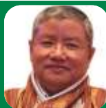
Dr. Lyonpo Kinzang Dorji Former Prime Minister of Bhutan

"Commerce Ministry has put in place a new Agri Exports Policy that aims at substantially enhancing India's trade and cooperation with the world. The bottleneck of infrastructure is being addressed, taking the States on board"