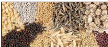
World Seed Congress