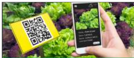
World Congress on Precision Agriculture