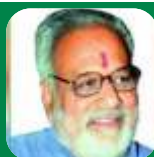
Professor Ganeshi Lal The Hon'ble Governor of Odhisa

"The self reliance in food has helped in strengthening and expansion of Indian economy, however, food and nutrition security for the rising population is a major challenge. For a food and nutrition secure India it is imperative that we establish R&D linked with farmers and extend market linkages to have a value addition chain."