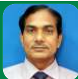
Dr. Trilochan Mohapatra Secretary – DARE and DG Indian Council of Agriculture Research Government of India

"For connecting farmers to markets there are two very important components which are also the drivers of agriculture i.e. technology and policy and have to be in harmony. Today startups are developing newer technologies which address the issues of farmers. It's high time we bring in new policies for startups to increase the collaborations for the growth of agriculture."