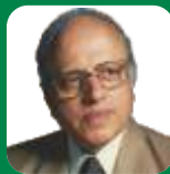
Prof. MS Swaminathan, Pioneer of India's Green Revolution

"Agriculture must also use technologies that depend on ecologically sound and responsive principles. While talking about the adoption of technology we also cannot ignore the need to encourage entrepreneurship in agriculture through skill development. We could raise army of agripreneurs who would make agriculture profitable."