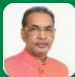
Mr. Radha Mohan Singh Hon'ble Minister of Agriculture and Farmers Welfare, India

"Agriculture need to be made more productive and rewarding by tapping the potential altogether of horticulture, dairying and food processing. Agriculture would be the sunrise sector in India by 2021 and will see unprecedented growth."