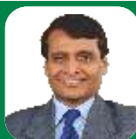
Mr. Suresh Prabhu Hon'ble Minister of Commerce and Industry, India

"The government, for the benefit of farmers, has initiated several programs in the areas of infrastructure development, agriculture education, research, international cooperation, processing and technology transfer among others"