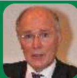
Dr. Rudy Rabbinge Special Envoy – Food Security Government of Netherlands

"Limited access to finance and credit, high post harvest losses, low value addition, and low participation of private sector in agriculture are some of the challenges. Policy measures are needed to overcome these and promote agricultural growth."