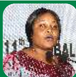
Ms. Kampamba Mulenga Chilumba Chewe, Hon'ble Minister of Livestock & Fisheries,

Agriculture has transformative power. The key to uplifting people out of poverty, ending malnutrition, ending hunger, is how we can elevate farmers to give them a better life, more income, because with more income they can buy other nutritious food and fulfil other requirements of their families and every one's life is transformed."