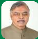
Shri Justice (Retd) P.Sathasivam The Hon'ble Governor of Kerala

"The effects of climate Change are impacting every aspect of life including agriculture, we need to evolve strategies to cope with the changing climate, depleting resource base and increasing food demand. This calls for policy changes in agriculture sector. We should focus on developing climate resilient crops. We need to develop crops that can withstand extreme weather conditions."