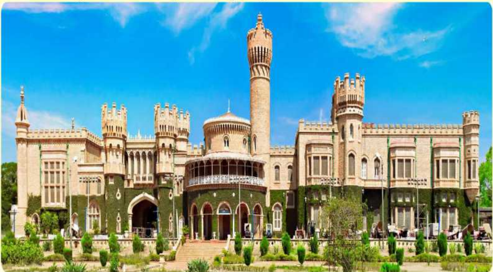
(Bangalore Palace, Bengaluru, Karnataka)

WCC2023 will bring together leaders and decision-makers from more than 100 countries to discuss, debate and collaborate towards building a sustainable coffee industry, right from bean to cup. "Sustainability through circular economy and regenerative agriculture" - will be the underlying theme for the week-long event which will include a 3 day conference and B2B exhibition, skill-building workshops, Global CEO conclave and a plethora of networking events. Over one lakh visitors are expected to visit the event which will be held at the historic Bengaluru Palace. WCC 2023 is promoted by the International Coffee Organization and is organized every four years.